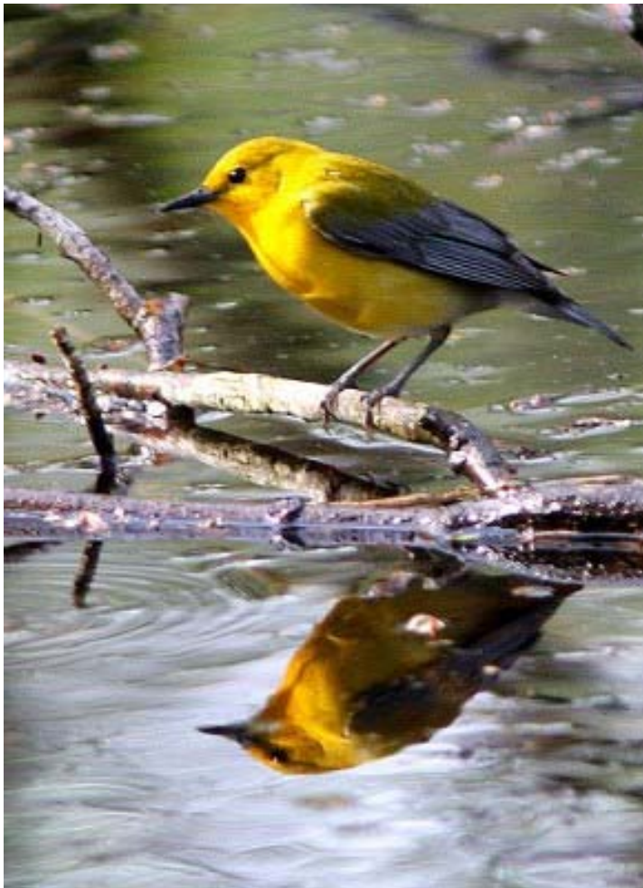
Prothonotary Warbler

And so the day went. Bobolinks in a small pasture field were certainly a welcome sight. Dianne Salter's feeders yielded Indigo Buntings , Orioles , a Hummingbird , three species of Woodpeckers and a singing Blackpoll Warbler that Steve was able to find in one of the trees. A Bluebird near its box, a singing Blue-wing Warbler along the road, a Field Sparrow in a meadow, our list was growing at a much slower pace than Birdathons of the past; but we were having fun and enjoying the now quite lovely day. Sandwiches, wraps and other goodies courtesy the Blue Elephant in Simcoe were eagerly devoured.