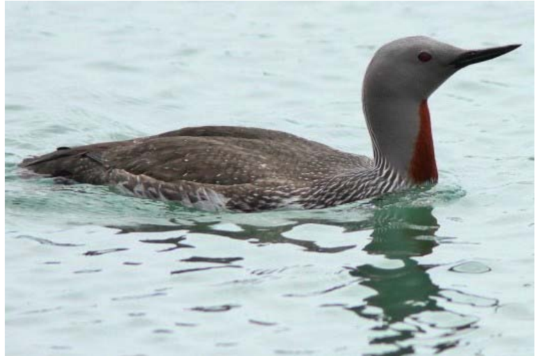
Red-throated Loon

Read more about this all-time Birdathon first in George Pond's report on page 4