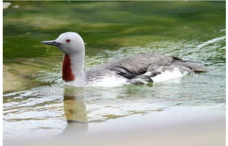
Red-throated Loon

We had stopped along the cemetery road for the Rough-wing swallows that could usually be found there. Bruce had seen them from the car. He didn't realize that we would be walking along the road for a while so he stayed in the car.