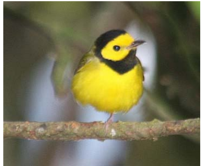
Hooded Warbler