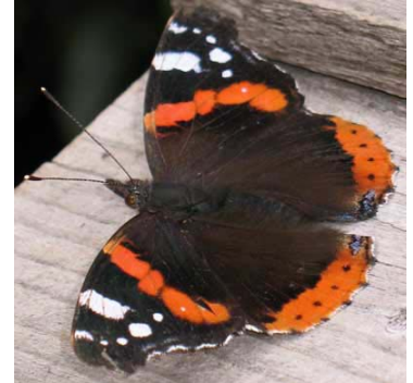
Red Admiral Common Buckeye

Are there other butterflies that migrate?