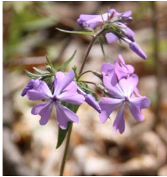
Wild Blue Phlox

Near the Turkey-release cairn was our only sighting of a Silvery Lupine ( Lupinus argenteus ) in full bloom. These hardy legumes thrive in dry habitats reaching moisture deep down with their long roots. Colleen's group set out into the woods looking for more spring ephemerals along the trail. These early flowers take advantage of the light streaming down through the tree canopy, before the leaves emerge blocking out the sun. Some of the earliest ones had already flowered leaving only the green parts of the plant as evidence of their presence. Large patches of Trout-lily ( Erythronium americanum ) leaves were carpeting the forest floor. The mottling, from which they get their name, remained barely visible. A few fading Red Trilliums ( Trillium erectum ) persisted.