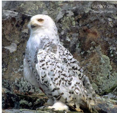
SNOWY OWL George Pond