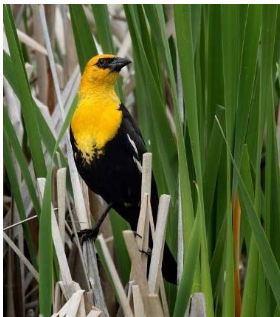
Yellow-headed Blackbird

American Crows were counted in their highest numbers since 2009 with 828 being counted, 600 seen near Cranbrassil. Brown Creeper's numbers were up after being down the last 3 years, this count 8 were seen. Eastern Bluebird numbers are still dropping from 39 seen last year and 20 counted this year. Once again the Fisherville count has 1 Myrtle Warbler . Snow Buntings must still be up north waiting for the snow because only 40 were counted, the last time the numbers were this low was 1997 when 1 was seen.