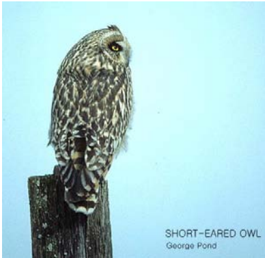
SHORT-EARED OWL George Pond

We were certainly not disappointed with a surprise Northern Mockingbird flitting about on a lawn just south of Fisherville that had just two trees on it making viewing easy.