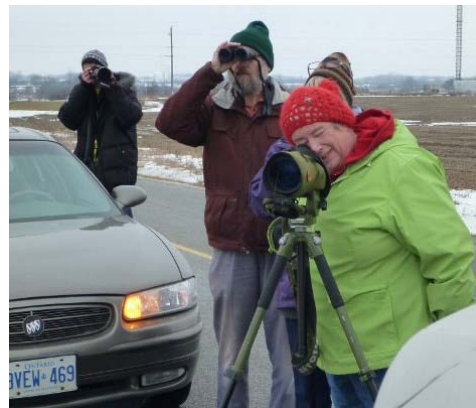
Birders: L to R

There is something about the call of the outdoors that brings birders together, regardless of the weather, and Sunday January 18, 2015 was no exception. A group of 13 birders flocked to the shores of Lake Erie, all were eager to venture forth and find birds a little less common than the handful of Mallards and Ring-Billed Gulls that were gathered around the Port Dover Harbour.