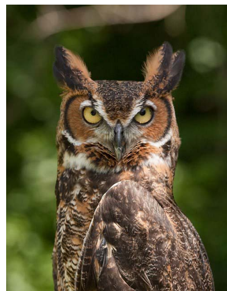
Great Horned Owl