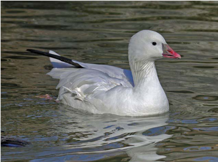
Ross's Goose - one of the 2 new species to the count